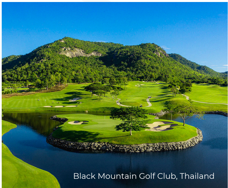
Black Mountain Golf Club, Thailand

If you are looking to see what all of the fuss is about, then give us a call on 01342 811777 to have your best golf holiday yet, visit our website