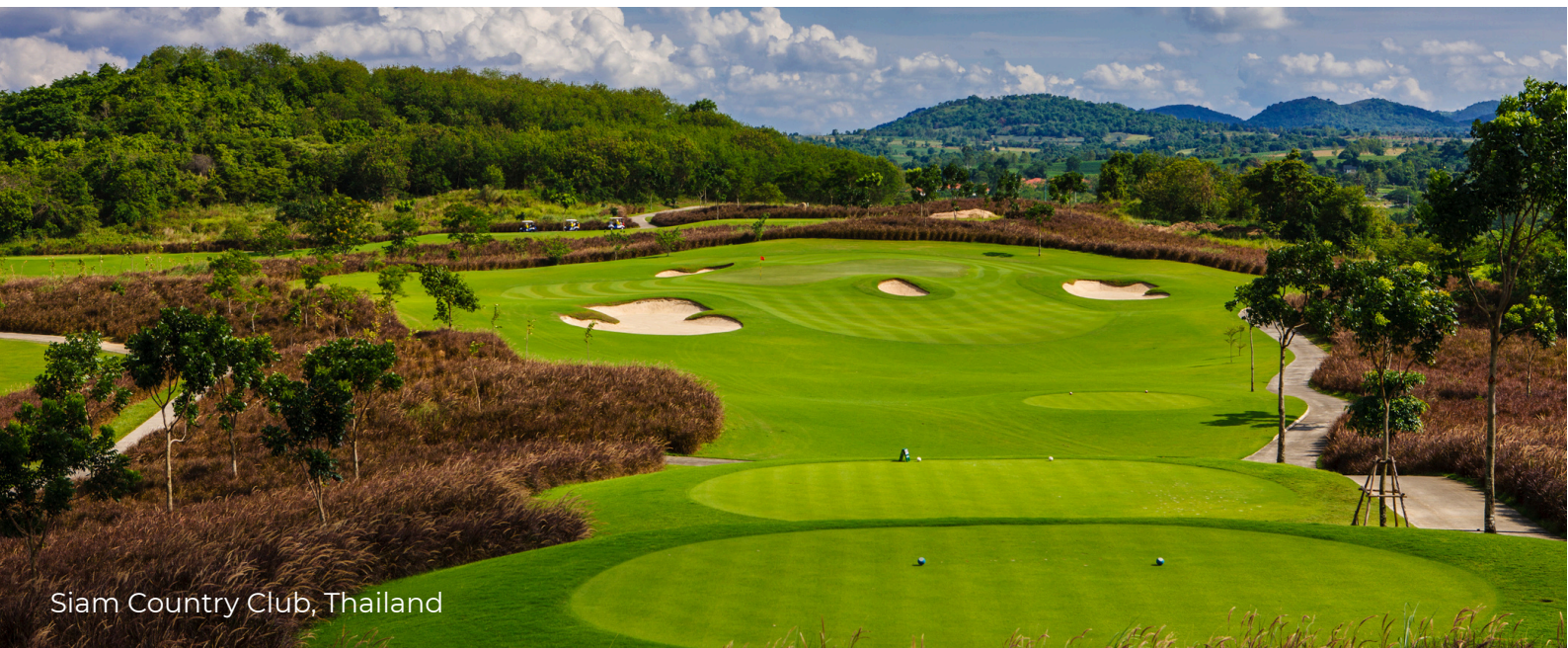
Siam Country Club, Thailand

Speaking of rewards... every booking earns Escape Points, giving you money off your next trip. Because loyalty should always pay dividends.