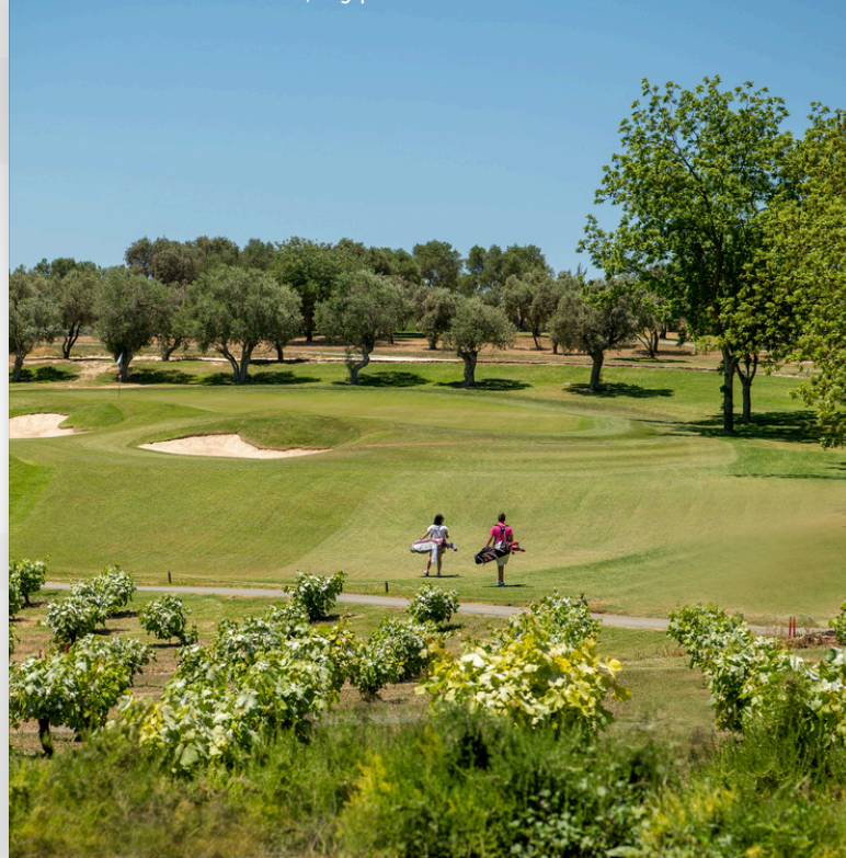
Minthis Golf Club, Cyprus

With over two decades of specialist knowledge, full financial protection, and a team that lives and breathes golf travel, your holiday couldn't be in safer hands. And value? That's part of the package.