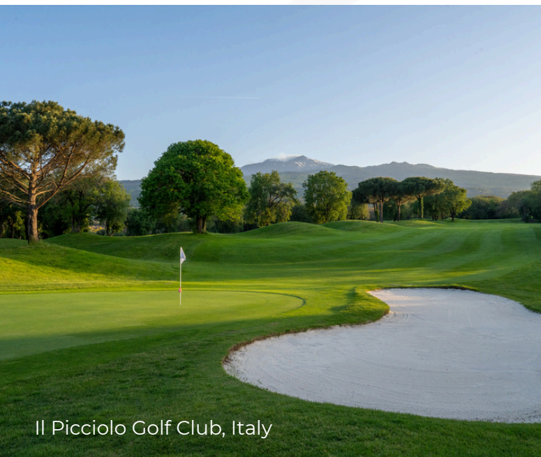
Il Picciolo Golf Club, Italy

It's why we've earned the Platinum Service Award for four consecutive years — and why so many golfers trust us with their next escape.